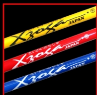
HMR COATING SURFACE