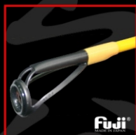
FUJI MNST (SiC) GUIDE