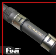
FUJI DPS REEL SEAT