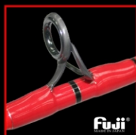
FUJI HNSG (SiC) GUIDES