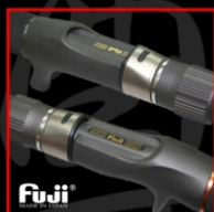
FUJI TCS/PSS REEL SEAT