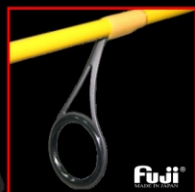
FUJI YSG (SiC) GUIDES