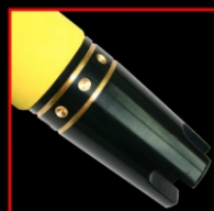
CUSTOMIZED ALUM. GIMBAL