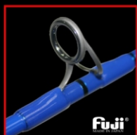
FUJI MNSG (SiC) GUIDES