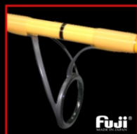
FUJI MNSG (SiC) GUIDES